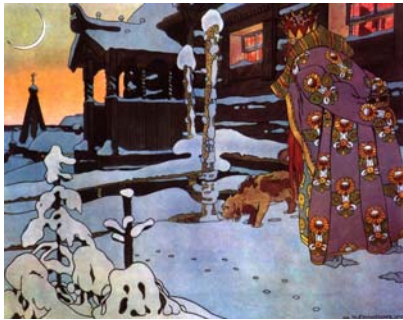
Tsar Saltan (Bilibin 1)

“He had heard the last girl’s pledge Standing hid behind the hedge.”