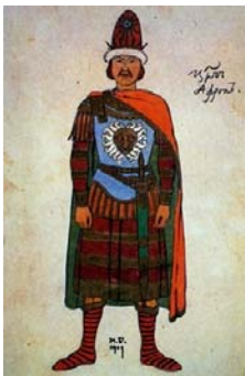
The Tsar's Son Afron