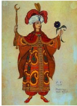
The Shemakha Queen