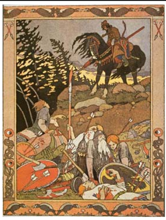
Ivan Bilibin, 1876–1942 Prince Ivan and the Defeated Forces (1901)