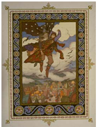
Boris Zvorykin (b. 1872) Koshchei the Deathless and Maria Morevna (1920s?)